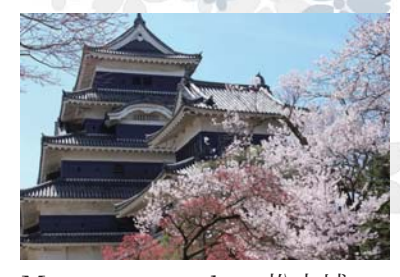
Matsumoto-castle \sim 松本城 \sim 75+10 minutes by bus.