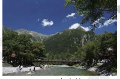
Kamikouchi ~上高地~ 25 minutes by bus.